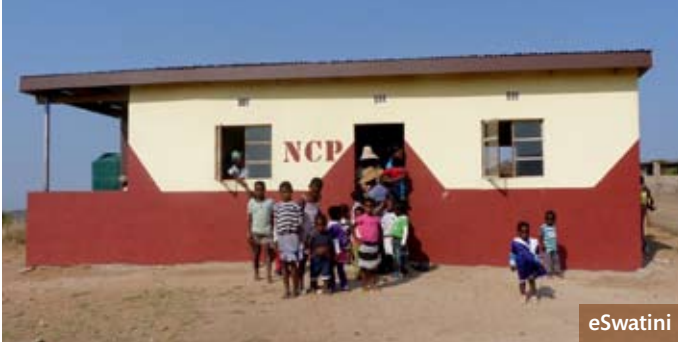
Picture above: mobile medical supply Picture below: one of about 100 NCPs

Rotary Club Sankt Goarshausen-Loreyley donated an ambulance being supported by the partner club in Martin/Slovakia and Rotary International as well as Rotary Club Mbabane/Swaziland .