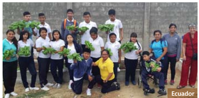
Salads cultivated by the Melvin Jones to provide for a better diet

In Ecuador the support of the Melvin Jones facility , taking care of disabled people, was continued. The same applied to the support of Helping Kids in Ecuador .