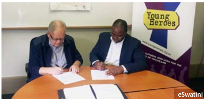
Partnership with Young Heroes set out in writing

In Swaziland we had found a new partner called Young Heroes enjoying great reputation. We had to finish the collaboration with Hand in Hand Swaziland (HiH SZ) since they didn't manage to realise our ideas of professional and effective development aid. Moreover, after we had made much effort to find out more about HiH, we established that the organisation had already been deeply in debt before we assumed responsibility for them. For this reason the break up was inevitable. Under the umbrella of Young Heroes the aid project with the new name Litsemba could be continued to the full extent. Four ambitious and loyal staff members of the previous partner were taken over and provided for a smooth transition.