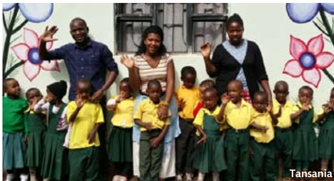
The Flowers Children's Centre takes care of about 90 children